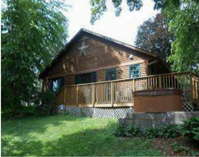
Facing east, Goodhue County Assessor photo, 2019.