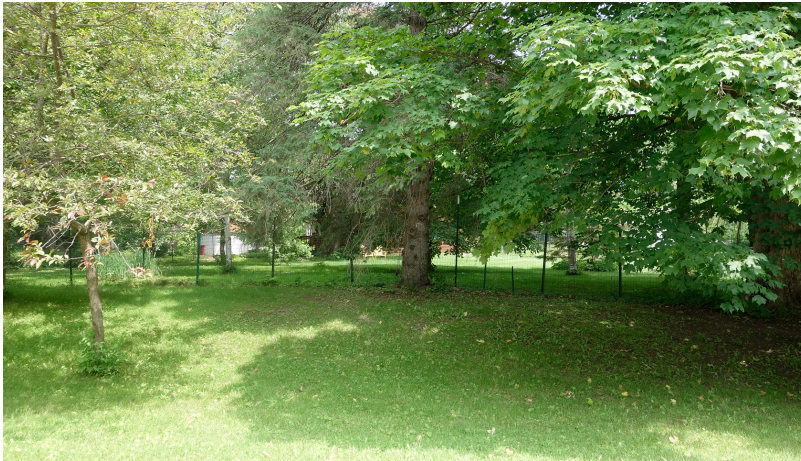
Facing east, property sited behind trees as seen from Westervelt Avenue Way, 6/14/2022.