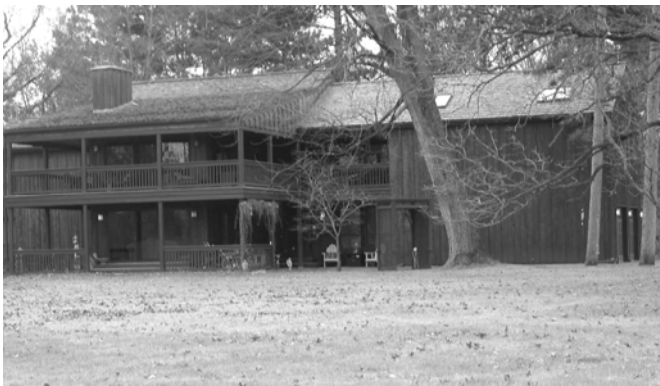
Knudsen Home Garrard Avenue and Green Street