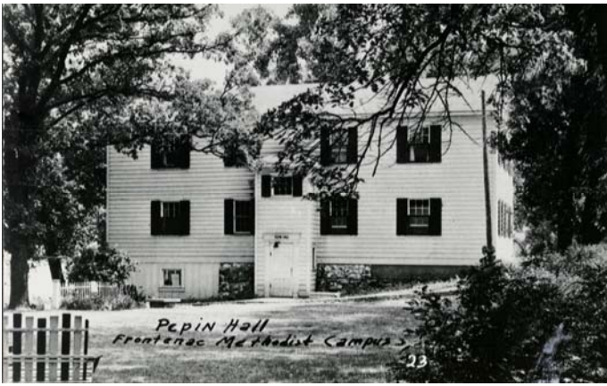
Pepin Hall – 1950 28822 Lake Avenue Way