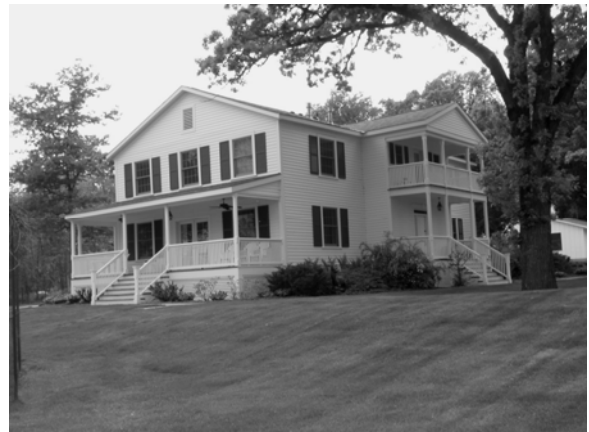
Chateau Frontenac B&B – 1996

1946. Pepin Hall was erected on the Methodist Campus using the lumber from Methodist churches located at Reads Landing and Hay Creek Township. The building was restored and converted to a Bed & Breakfast by Chateau Frontenac, Ltd. in 1996. It is now a private home.