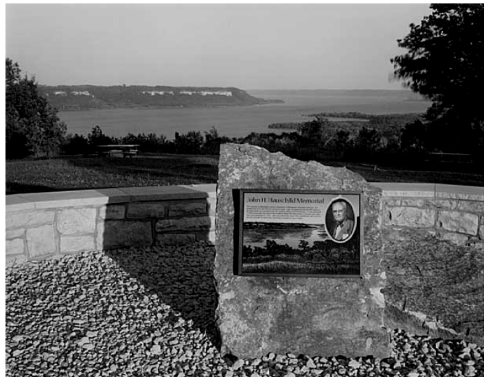
Frontenac State Park Monument

1957. Frontenac State Park, which surrounds Frontenac on 3 sides, is dedicated as a Minnesota State Park. Over time, the park expands all the way to Wacouta as adjoining lands become available for purchase.