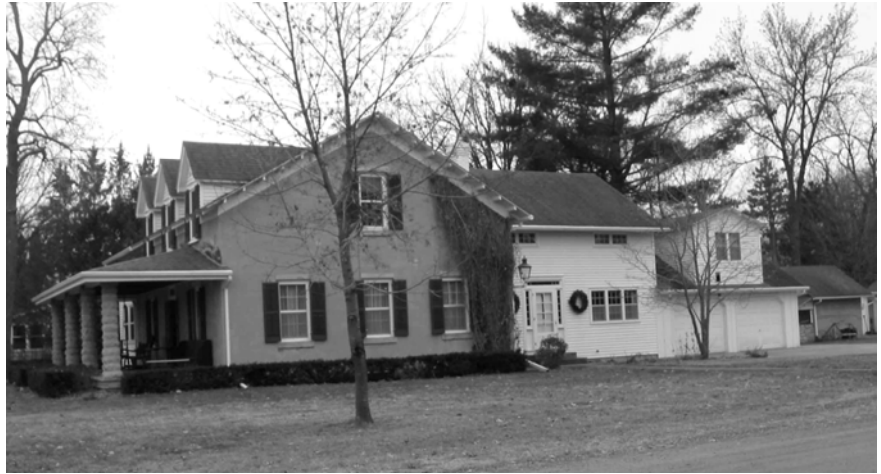
Greystone (Wild Wings Founded in Dormer Over Garage)