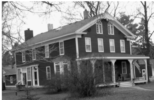
Lowell House Bed & Breakfast NW corner of McLean Street and Wood Avenue