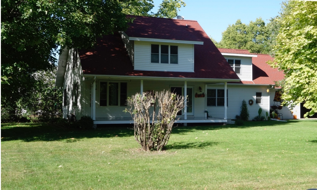
34879 County Road 2 Boulevard (McLean Street), facing northeast. 9/15/2021.