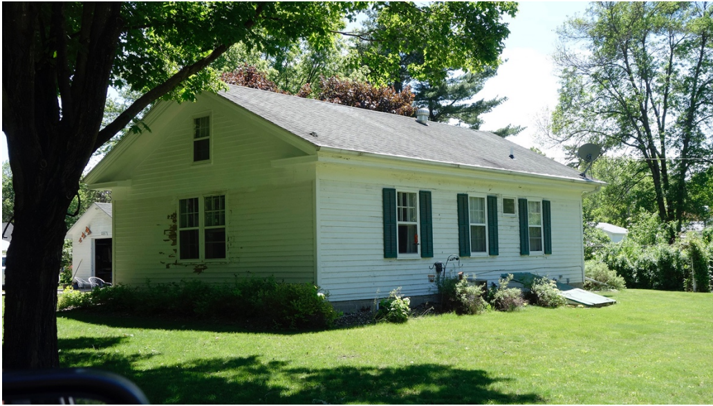
28891 Manypenny Avenue, facing southwest. 9/15/2021.